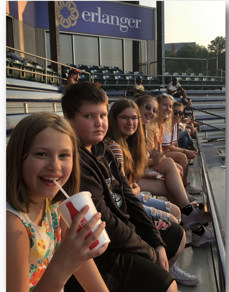
SCM Youth enjoyed a fun night at the Chattanooga Lookouts Game in June.